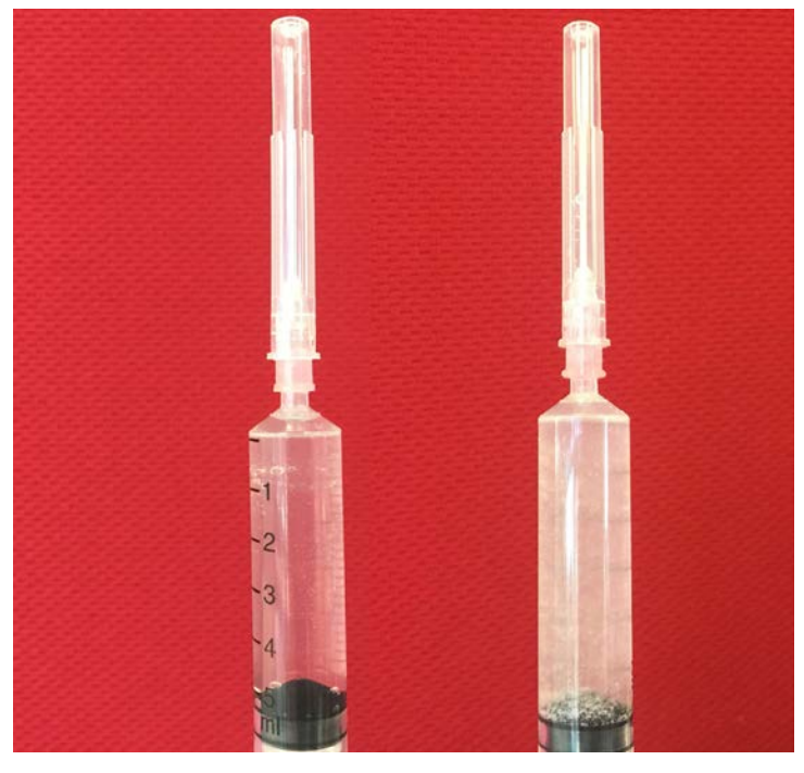
Left Filtered with 0.8 Micron GREEN Wheel filter Right Unfiltered

If you are going to inject drugs it is really important that you filter them properly. It only adds a few seconds to your preparation time to use a needle filter or wheel filter and they are very easy to use.